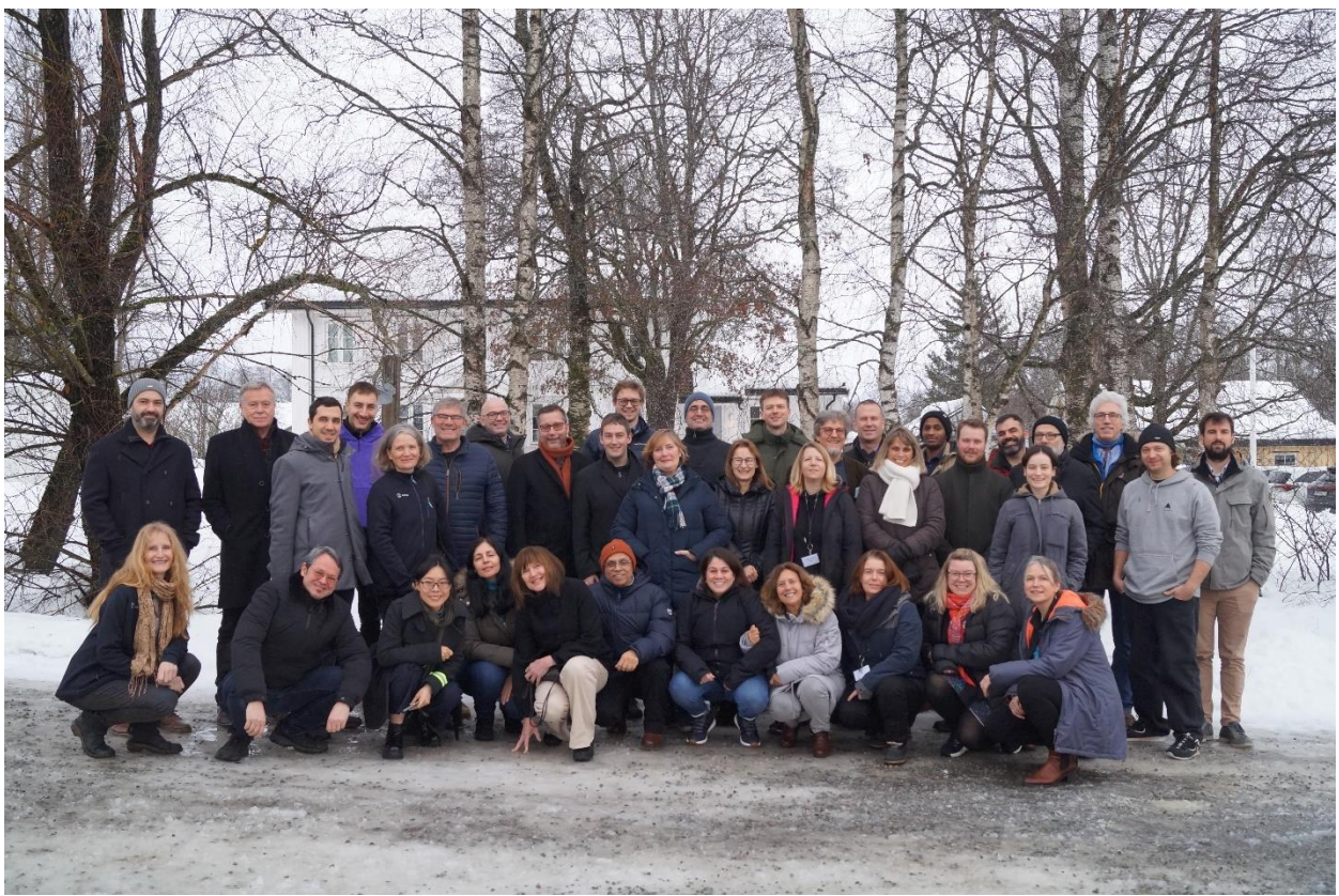
Figure 1.1: All participants of the PurPest Kick-off meeting, taken on January 13<sup>th</sup>, 2023 outside of Kringler Gård Guesthouse, Maura, Norway.