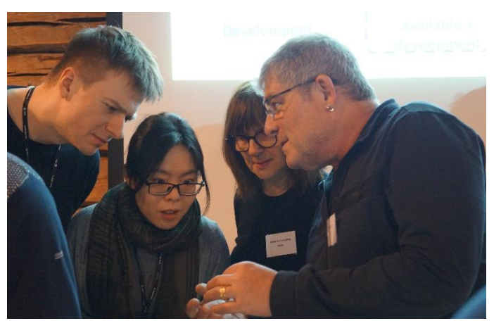
Project participants from VOL, JKI and NTNU in discussion.